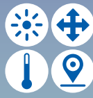
Wireless Sensor Networks